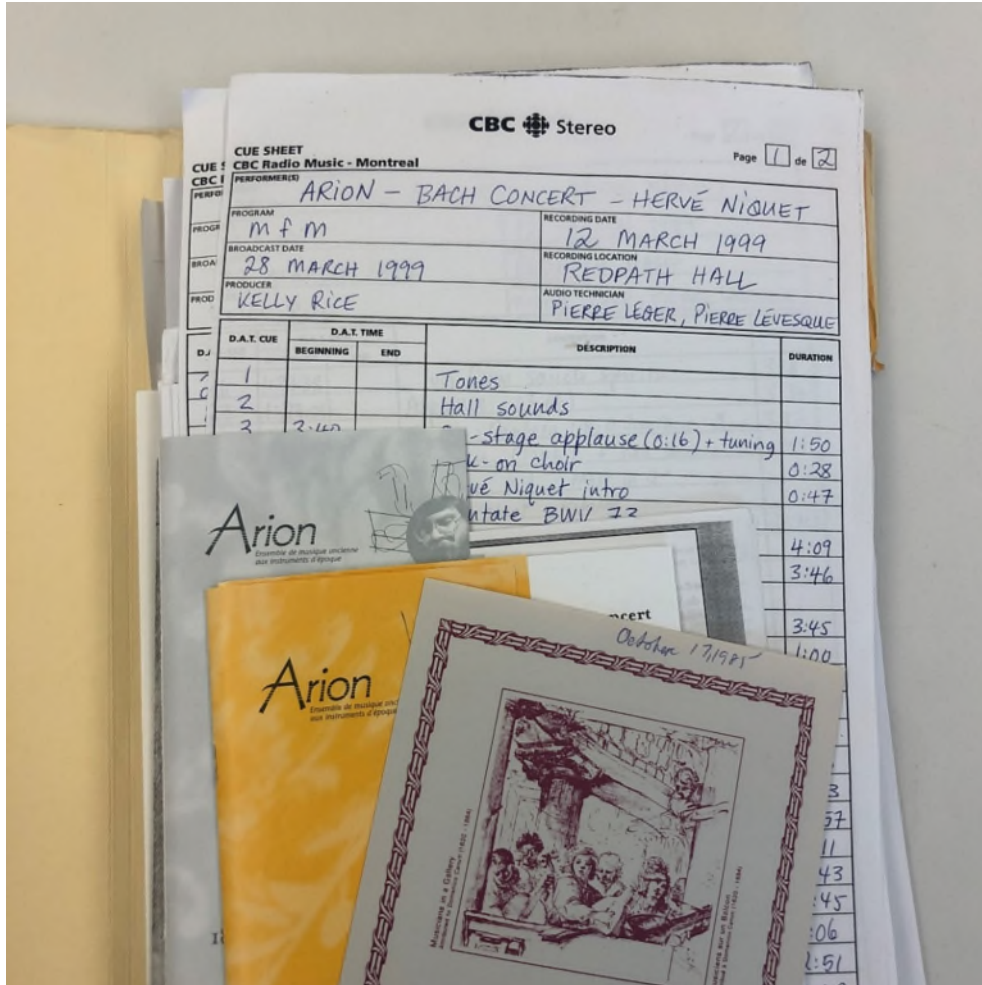
IMAGE 2. FOLDER: ARION ENSEMBLE. SHOWN HERE ARE CONCERT PROGRAMS AND CBC CUE SHEETS. ARION IS A MONTREAL-BASED BAROQUE ORCHESTRA FOUNDED IN 1981. IT HAS STRONG TIES WITH BOTH THE LOCAL MUSIC SCENE AND MCGILL AS THERE HAVE BEEN, AND CONTINUE TO BE, A NUMBER OF MCGILL FACULTY MEMBERS AND ALUMNI AMONG ITS MEMBERS. THE ARION FOLDER CONTAINS PROGRAM NOTES, PRODUCTION NOTES, CUE SHEETS, RADIO SCRIPTS, CLIPPINGS, BIOGRAPHIES, CORRESPONDENCES, AND PRESS RELEASES FOR OVER 20 CONCERTS HELD IN COLLABORATION WITH THE CBC.